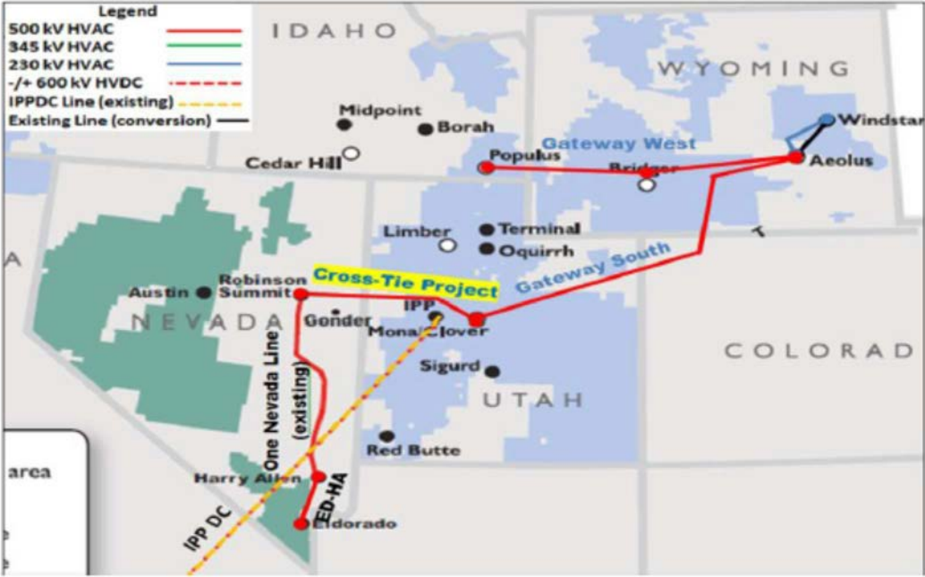
Figure 1: Cross-Tie Project Overview {Subject to change based on Sponsor’s review }

The project would be required to satisfy the requirements of the National Environmental Policy Act (NEPA) and the Bureau of Land Management (BLM). A significant portion of the routing of the line has been previously studied under the Southwest Intertie Project Environmental Impact Statement, which received federal approval in a Record of Decision published in 1994 but was not constructed. Further, the project would be subject to the state approval processes applicable for Nevada and Utah. In any event, as the project is anticipated to follow existing transmission line corridors, TransCanyon believes that the risk of failing to obtain necessary administrative approval is considered minimal to moderate. According to TransCanyon, the project is expected to be in-service by 12/31/2024.