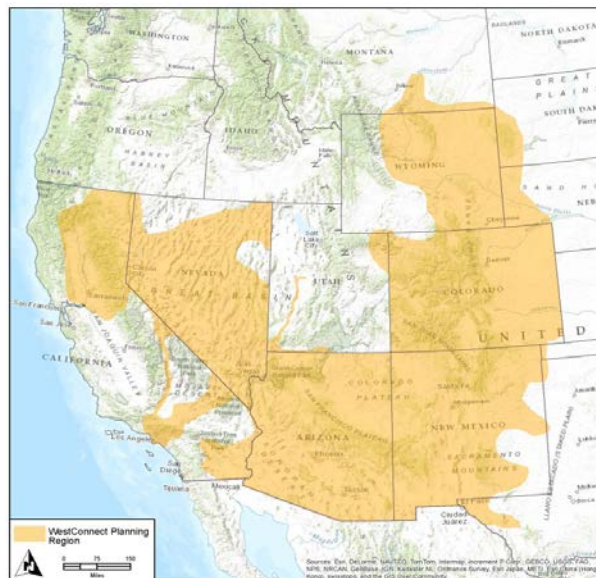
40 41 Figure 3: Approximate Footprint of WestConnect Member TOs and Participating TOs

38 WestConnect does not conduct FERC Order 1000 regional transmission needs assessments for TOs that 39 are not WestConnect members. The approximate footprint of member a TOs is shown in Figure 3 .