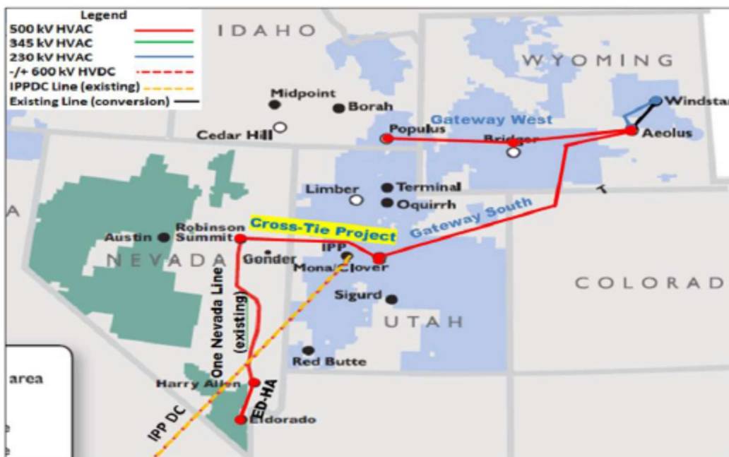
Figure 1: Cross-Tie Project Overview {Subject to change based on Sponsor's review}

received federal approval in a Record of Decision published in 1994 but was not constructed. Further, the project would be subject to the state approval processes applicable for Nevada and Utah. In any event, as the project is anticipated to follow existing transmission line corridors, TransCanyon believes that the risk of failing to obtain necessary administrative approval is considered minimal to moderate. According to TransCanyon, the project is expected to be in-service by 12/31/2024.